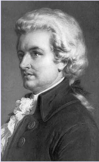
Wolfgang Amadeus Mozart.

In 1782 Mozart composed an unfinished piece of music about Britain's victory in the Great Siege of Gibraltar. Mozart, who disliked the French and described himself as an "arch-Englishman" in a letter to his father, Leopold, was invited by an unnamed woman in Hungary to compose a piece for voice and piano about Britain's defence of the territory by General George Augustus Eliott, Lord Heathfield .