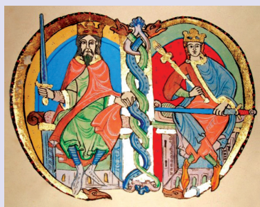
King David I and King Malcolm "The Maiden" from the initial letter of a charter to The Abbey of Kelso, 1159.