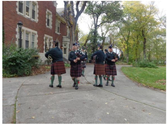
Queen's Own Cameron Highlanders in front of Ralph Connor House

The Ontario West Chapter would like to remind all Elliots that they are welcome to attend all our events held throughout the year.