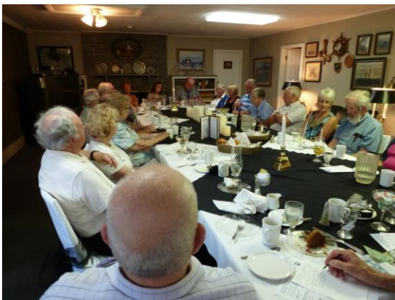
NB Chapter at the Timberland Motel