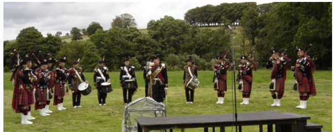
Pipes & Drums of the Kings Own Scottish Borderers.