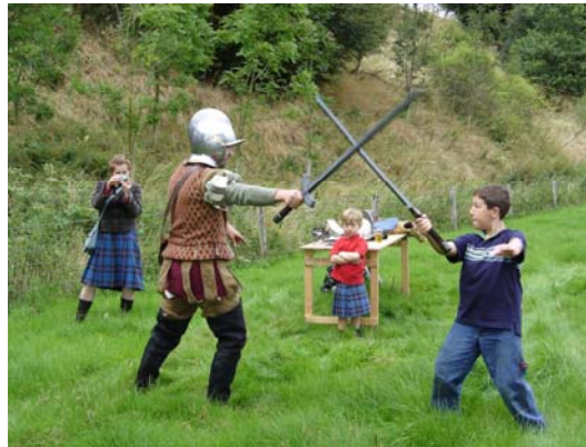
A young reiver-in-training.